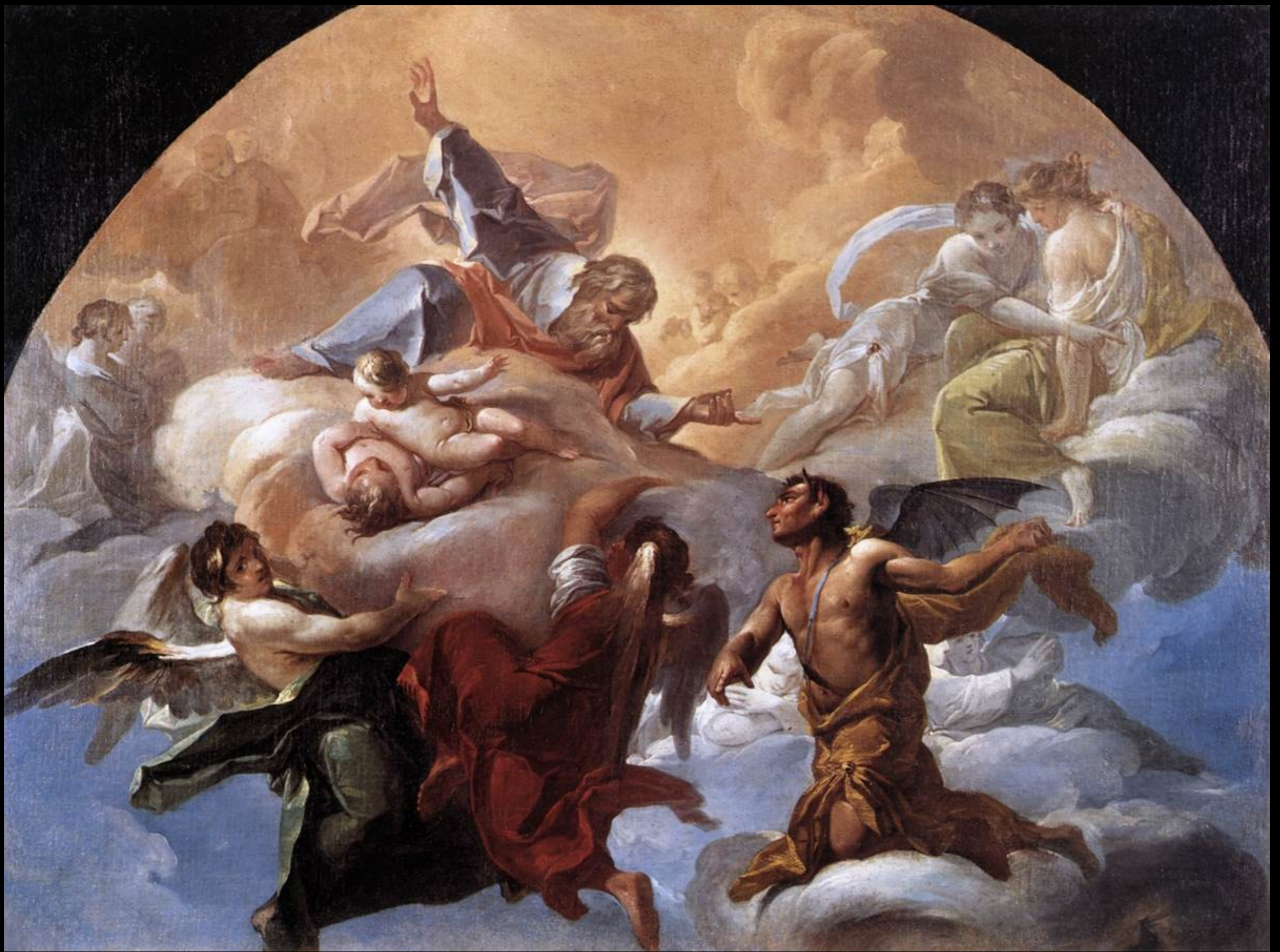
Moses, Israel, Satan and Job